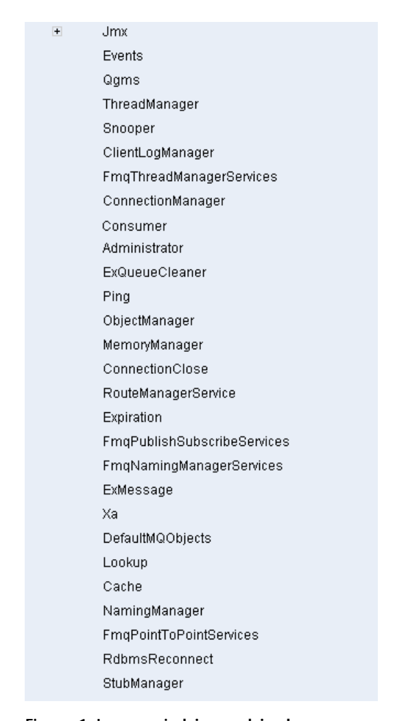
Figure 1: Loggers in hierarchical manner

Additionally the loggers are arranged in a hierarchical manner with parent-child relationships. Each element in the tree (Figure 1) has these two attributes as shown Figure 2.