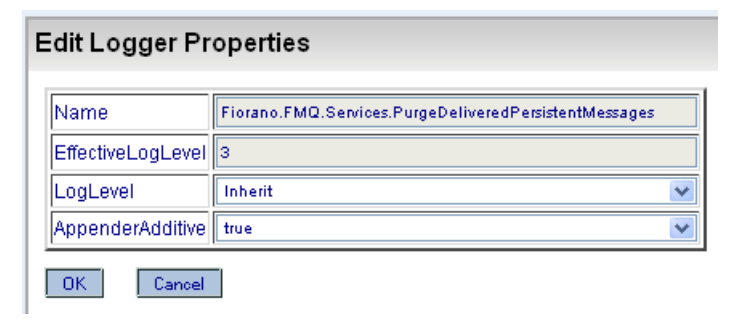
Figure 2: Edit Logger Properties dialog box

Additionally the loggers are arranged in a hierarchical manner with parent-child relationships. Each element in the tree (Figure 1) has these two attributes as shown Figure 2.