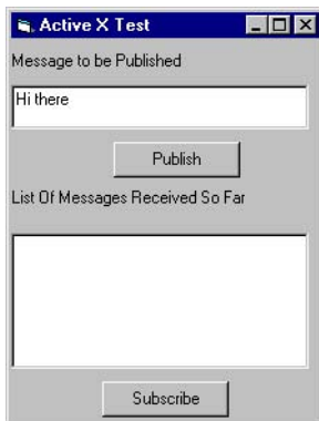
FIGURE 10-1 Sample VB Application using ActiveX Controls

A message is to be published first before subscribing to it, else Subscriber times-out after 5 seconds, and return a blank string.